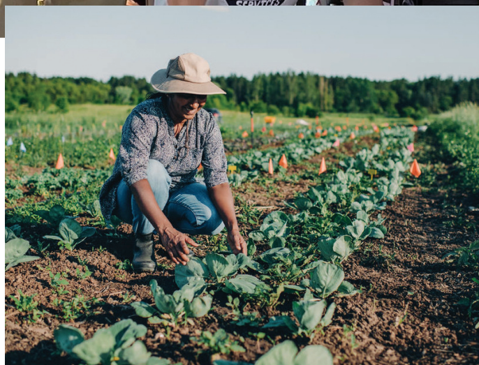
BIG RIVER FARMS

"Change Matters funding supported individualized services for 276 women, non-binary people, and children experiencing homelessness or other crises. These services, offered in our supportive housing and shelter programs, directly empower BIPOC women and children to achieve their goals and build healthy, stable